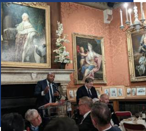
Launch event of the Entente Cordiale Prizes, April 2024, Chateau de Breteuil

The Entente Cordiale Prizes have been launched under the High Patronage of the President of the French Republic, Mr Emmanuel Macron and with the support of His Majesty King Charles III.