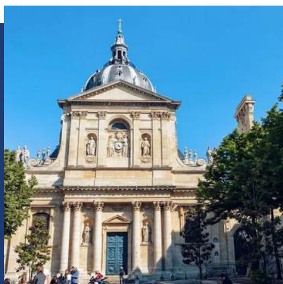
Place de La Sorbonne, Paris