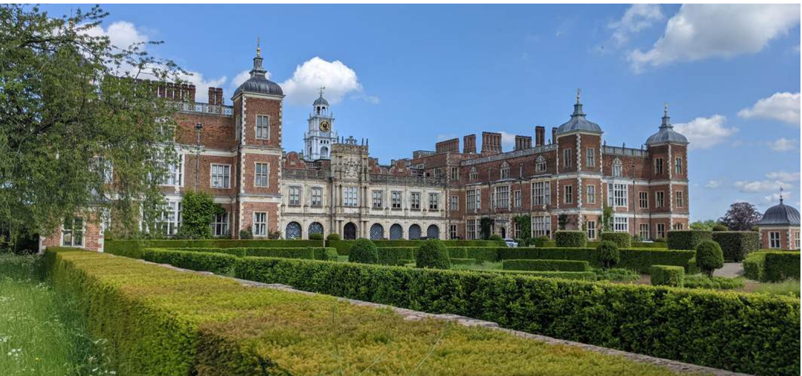
Hatfield House, Home of the Marquess of Salisbury, venue of the Entente Cordiale Gala Dinner in April 2025