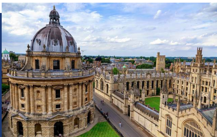
Radcliffe Camera Building, Oxford